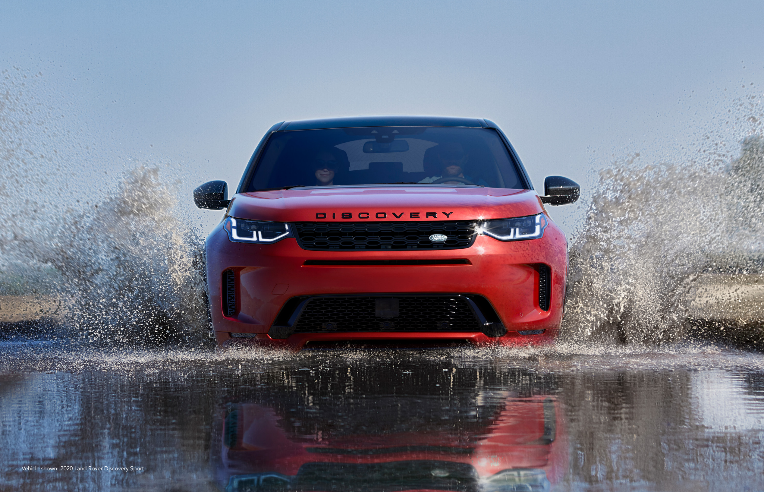
Vehicle shown: 2020 Land Rover Discovery Sport.