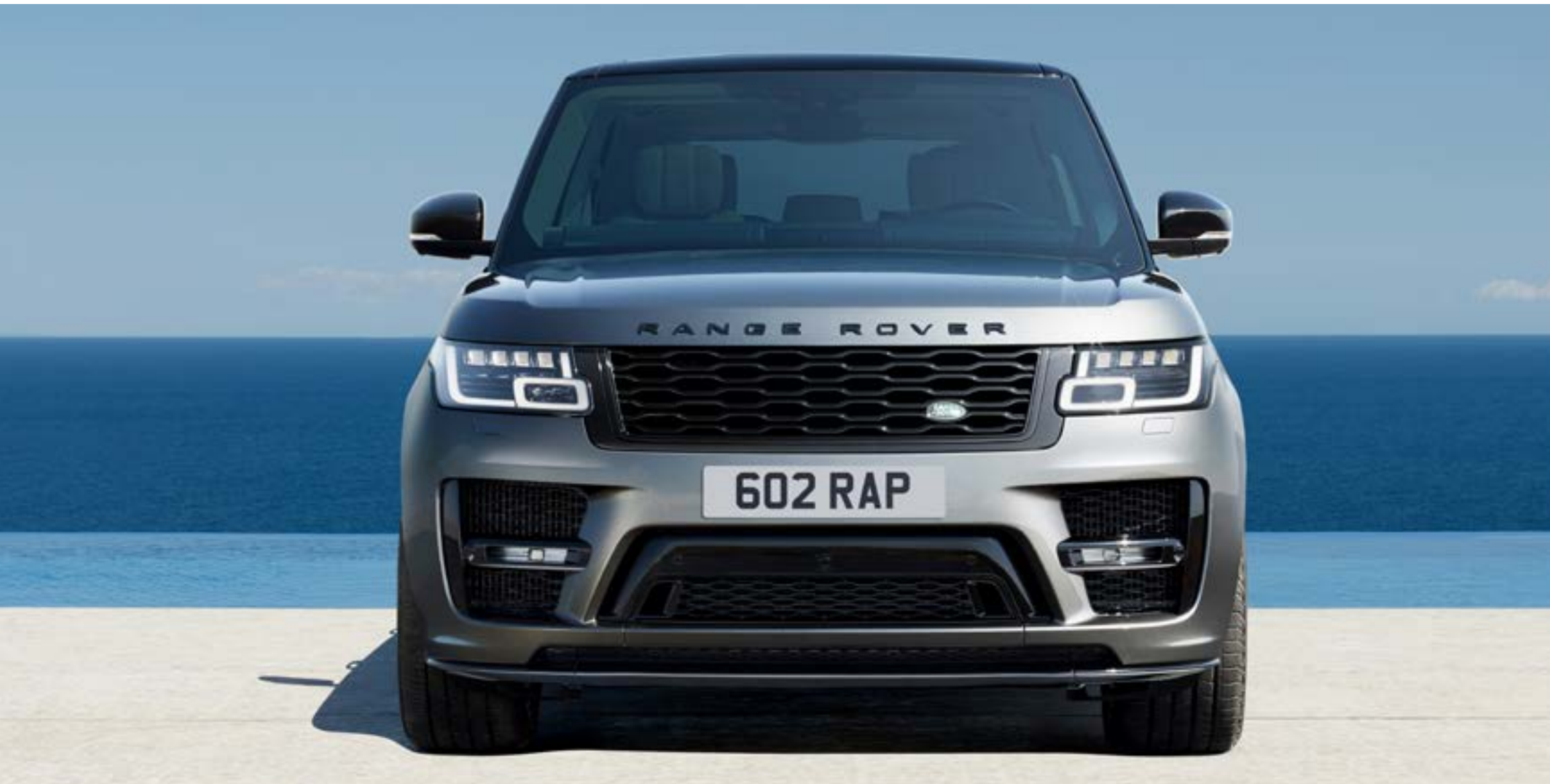
Radiator Grille and Front Bumper with Enlarged Intakes

SVO design packs provide purposeful, dynamic and stunning styling enhancements that allow you to add your own stamp of individuality by tailoring your Range Rover. SWB Exterior features include a unique front bumper, rear bumper with integrated tailpipes, side vents, grille and side sill plates.