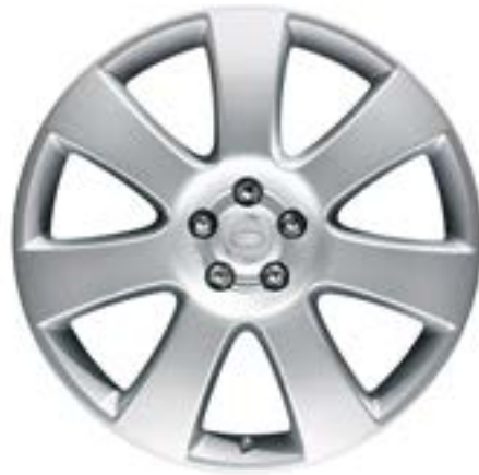
22" Style 7008, 7 spoke