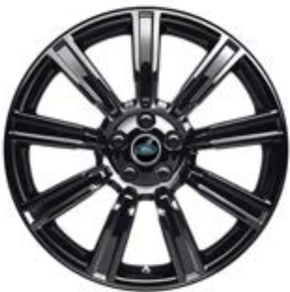
21" Style 9001, 9 spoke, Gloss Black