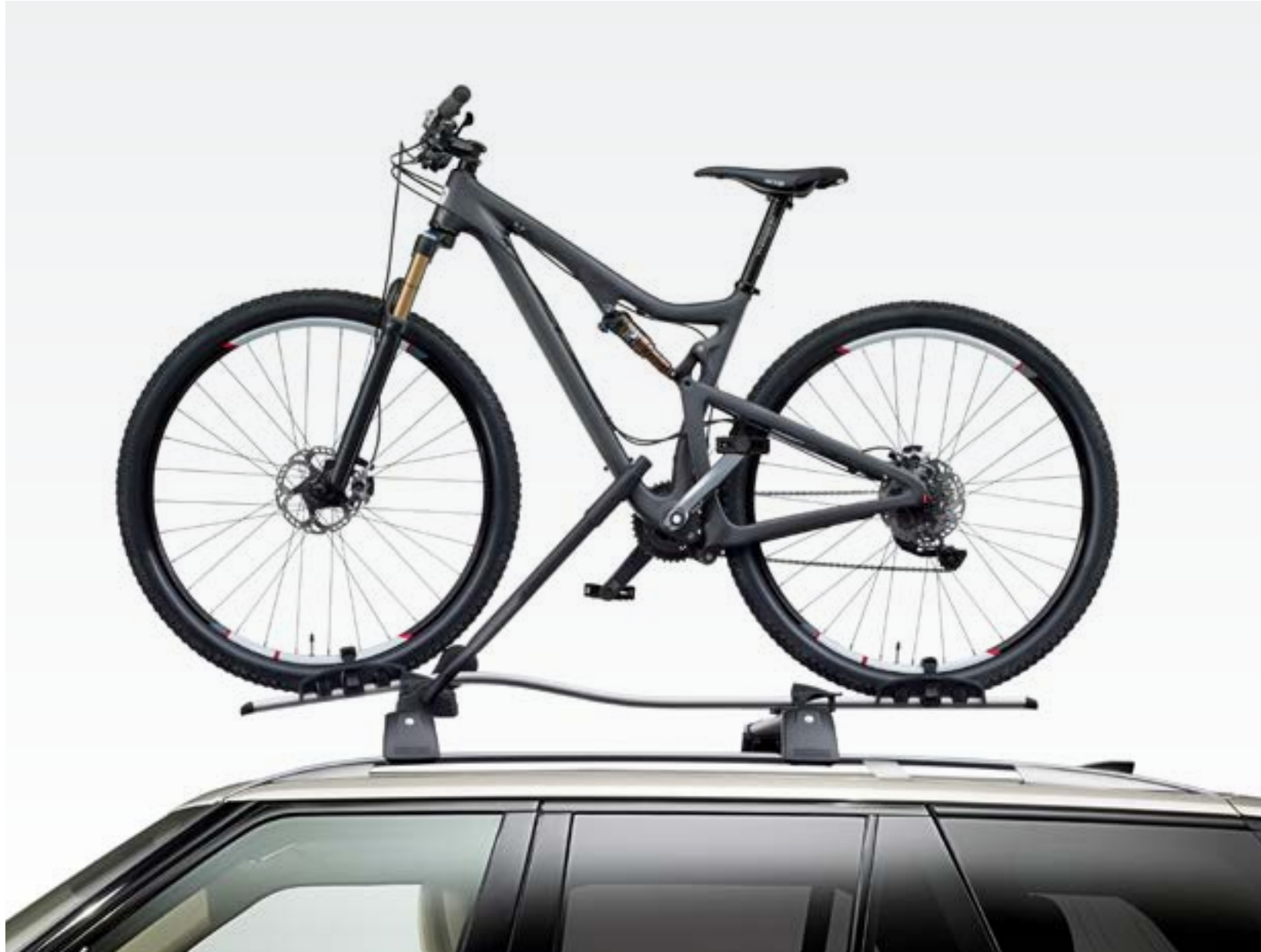
Wheel Mounted Bike Carrier

Roof mounted, lockable bike carrier designed for holding a single bike, up to 20 kg.