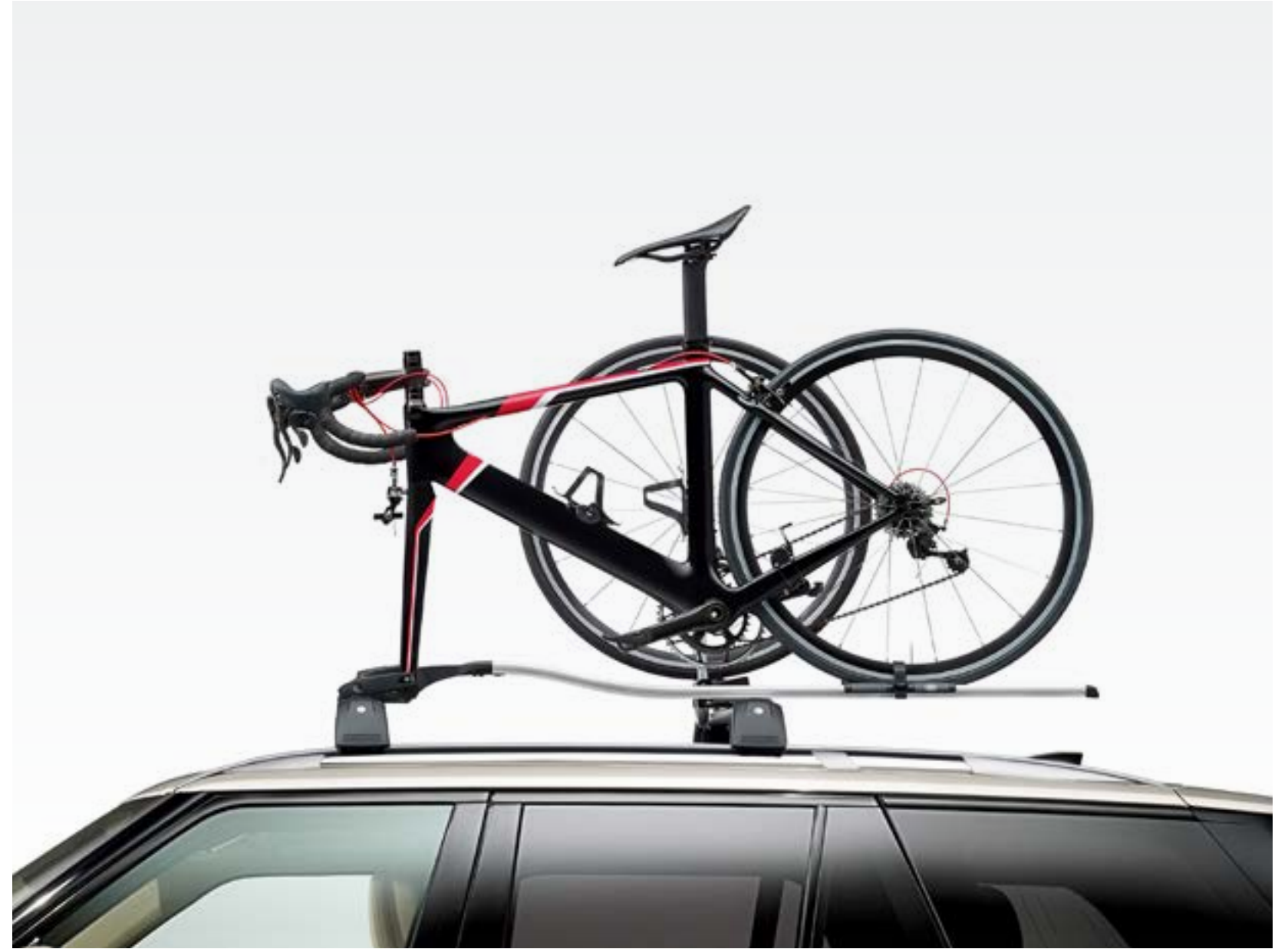
Fork Mounted Bike Carrier

Roof mounted, lockable bike carrier designed for holding a single bike, up to 20 kg.