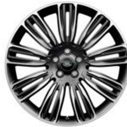
22" Style 9012, 9 split-spoke, Mid-Silver Diamond Turned finish