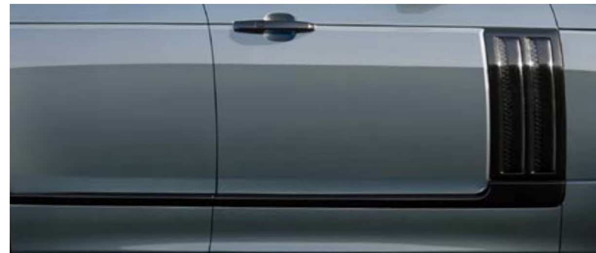
Side Plates and Side Vents