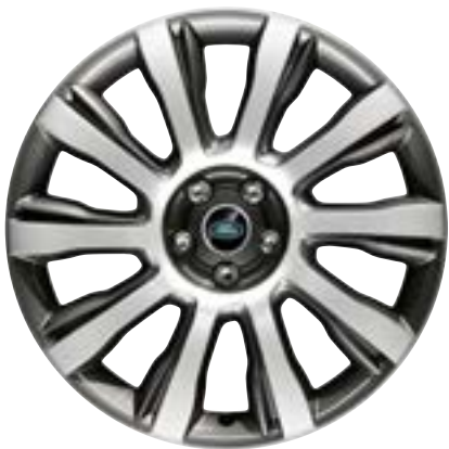
21" Style 1001, 10 spoke, Diamond Turned finish