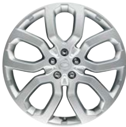
22" Style 5004, 5 split-spoke