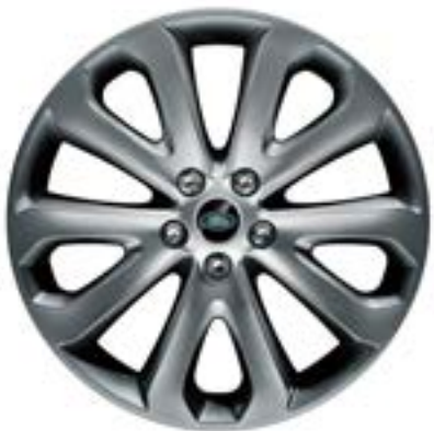
20" Style 5002, 5 split-spoke, Shadow Chrome