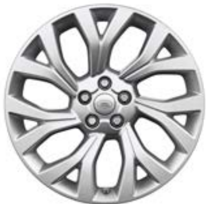
21" Style 7001, 7 split-spoke, Silver