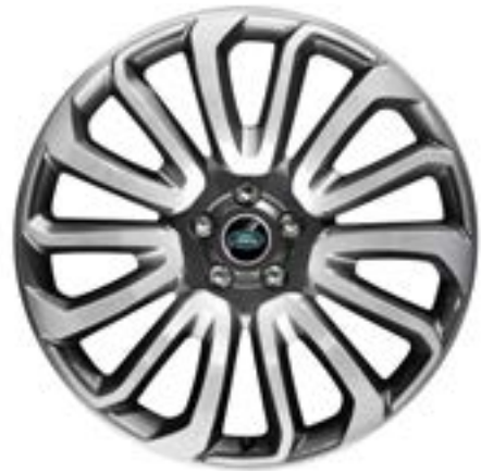
22" Style 7007, 7 split-spoke, Diamond Turned finish

Personalize your vehicle with a selection of alloy wheels featuring a wide range of contemporary and dynamic designs.