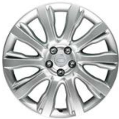
21" Style 1001, 10 spoke, Silver Sparkle