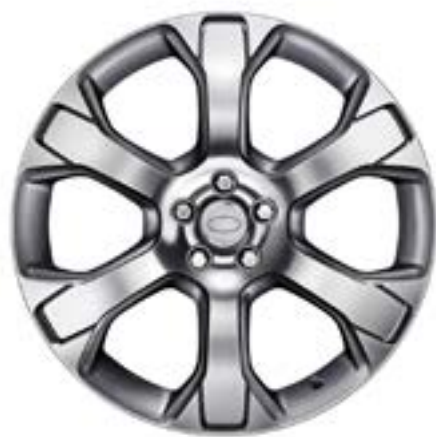
22" Style 6001, 6 spoke, Diamond Turned finish