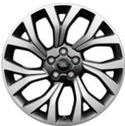
21" Style 7001, 7 split-spoke, Light Silver Diamond Turned finish