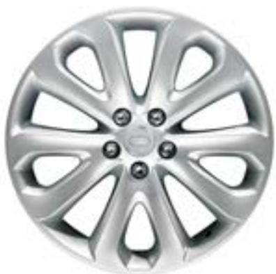
20" Style 5002, 5 split-spoke