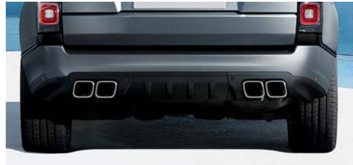
Rear Bumper with Integrated Bright Exhaust Finishers