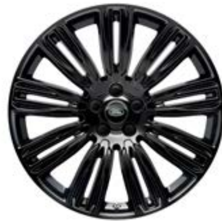
22" Style 9012, 9 split-spoke, Gloss Black