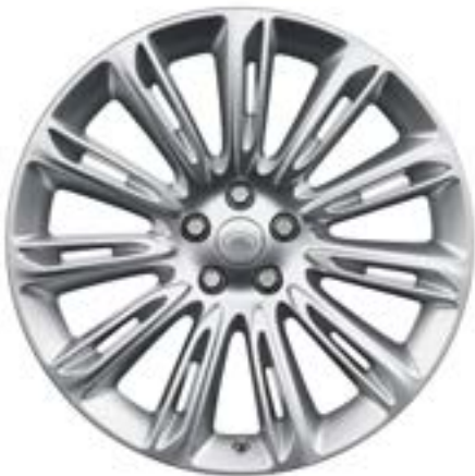
22" Style 1046, 11 spoke