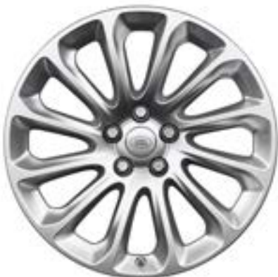
20" Style 1065, 12 spoke