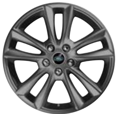
19" Style 5001, 5 split-spoke, Anthracite

Personalize your vehicle with a selection of alloy wheels featuring a wide range of contemporary and dynamic designs.